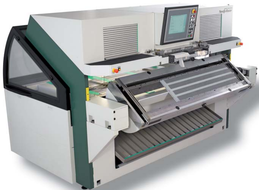
POTOTYPE OF THE NEEDLE MASTER

Function of the Needle Master is semi-automatic insertion and removal of needles from prevalent needle boards via multi-needle-looper, guide comp and customer-specific pitch-rails.