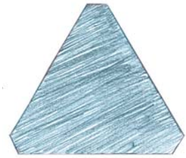
STANDARD TRIANGULAR WORKING PART